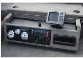
Electronics command center