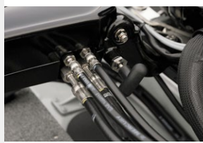
Hydraulic assist steering (optional)