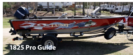
1825 Pro Guide