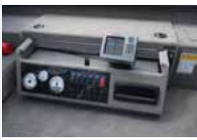
Electronics command center