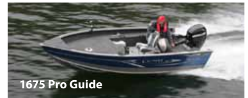
1675 Pro Guide