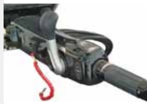
Big tiller handle (optional)